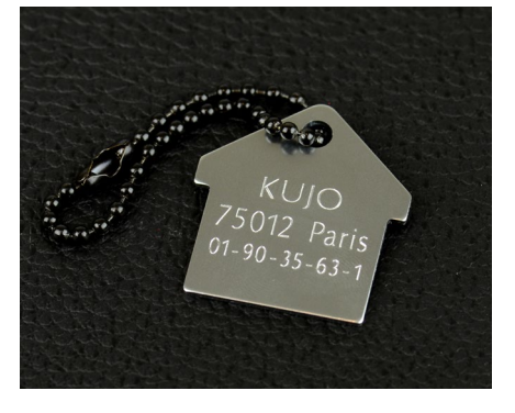
Pet and dog tags engraving