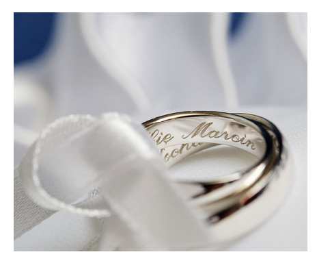
Personalizing and engraving jewelry