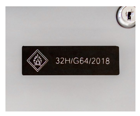
Marking tools for identification and equipment traceability