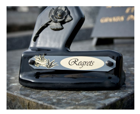
Funeral plaques and headstones engraving